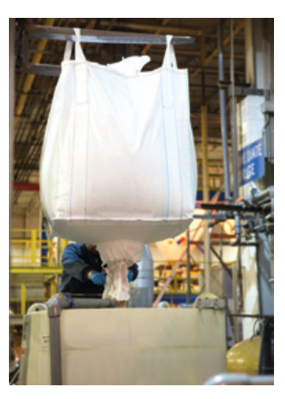
Four durable straps for easy, safe lifting.