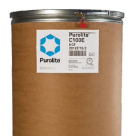
Standard Fiber Drums can incorporate tamper-evident seals.