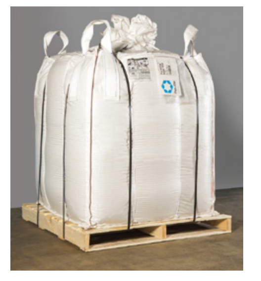
Bulk bags are securely strapped to pallet that features reinforced slats for increased strength.