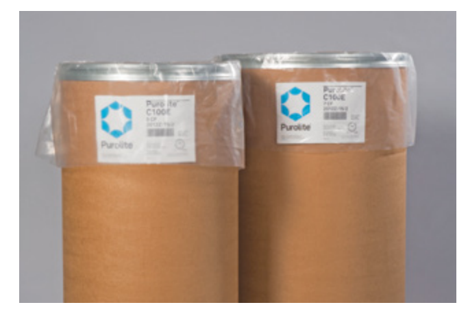
The interior of each Standard Fiber Drum is lined with a polyethylene bag to protect resin from humidity and debris.