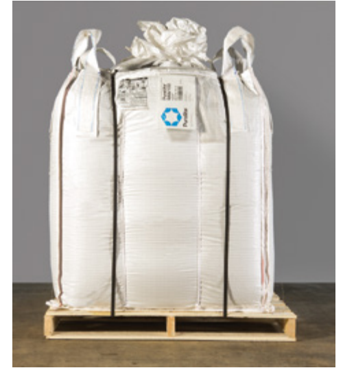
Integrated document sleeve prominently displays product name.